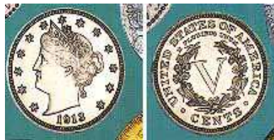
Figure 1: A gem proof condition 1913 Liberty Head nickel, one of only five known and the finest of the five. Collector Jay Parrino of Kansas City bought the elusive nickel for a record $1,485,000, the first and only time an American coin has sold for over $1 million.

What if the experiments can not be repeated? For example what is probability that Squiki the guinea pig survives its first treatment by a particular drug. Or "the experiment" of you taking ISyE8843 course in Fall 2004. It is legitimate to ask for the probability of getting a grade of an A . In such cases we can define probability subjectively as a measure of strength of belief.